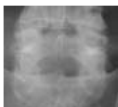
Figure 1 Plain radiograph of the spine demonstrating no obvious abnormality.

Clinical examination revealed a mild fullness in the right lumbar region with gross restriction in lumbar spine movements. There was obvious tenderness around the right lumbo-sacral area on deep palpation but there were no signs of superficial infection. There was no neurological abnormality in either lower limb but he was noted to be pyrexial.