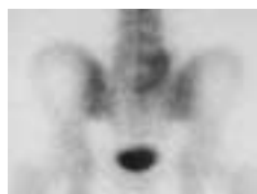
Figure 2 Bone scan demonstrating increased activity around the right L5/S1 facet joint and surrounding tissues.

Biopsy guided by x ray computed tomography (CT) was carried out to confirm the diagnosis of infection and establish a causative organism. The